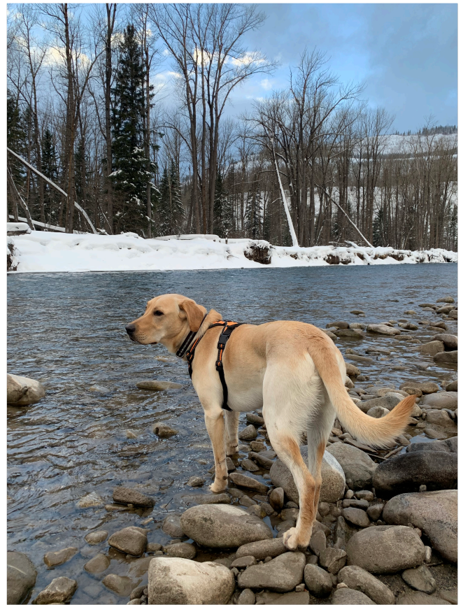
Thumper coming to the waters of the Elk River

I do invite you to spend a couple of minutes with the above passage from Isaiah and just remind yourselves that through the Church you are always welcome to come to the waters and to the rich food of God's Word and Sacraments, even it at the moment it is only accessible via Zoom!?! Remember, this is God's work, and God's will is that God can be found, found easily because God is near. So come to the waters, come to the banquet, and bring with you a hungry and thirsty friend.