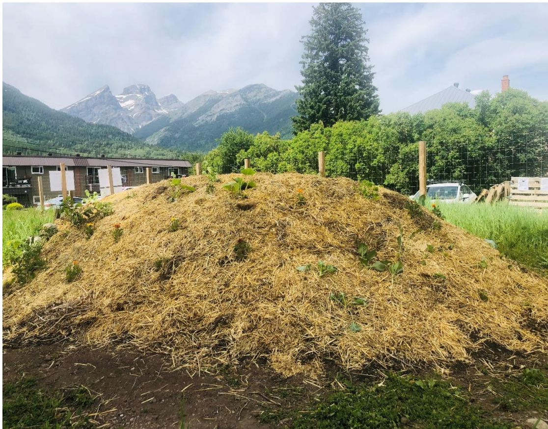
Fernie Family Garden Hügelkultur