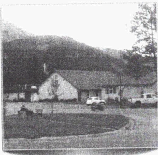
St. Michael's, Sparwood

Holy Family Parish, Box 519, Fernie, B.C., V0B 1M0