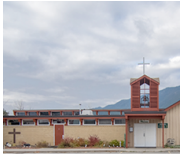
ST. MICHAEL PARISH SASPOOR, BRITISH COLUMBIA