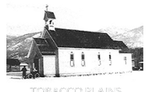
TOBACCO PLAINS MISSION SASPOOR, BRITISH COLUMBIA