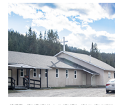
ST. BERNARD PARISH ELK FORD, BRITISH COLUMBIA