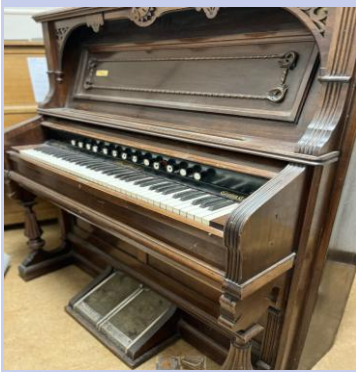
Old Pump Organ