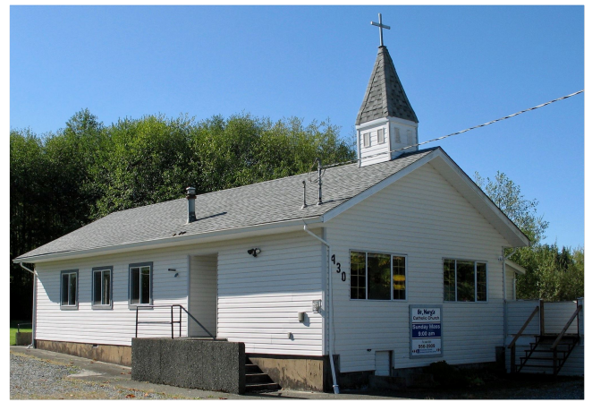
St. Mary's Catholic Church, Port McNeill

Port Alice receives 3.4m (130in) of rain each year; which compares with Fernie that gets about 0.9m (35in). This figure is one third more than even Prince Rupert which is often referred to as the wet spot of B.C., and three times what Vancouver gets, which is thought to be a rainy place to live. Thank goodness Thumper is happy to get wet.