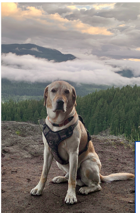
Left: Thumper on our walk after the rain through beautiful scenery near Clearwater.