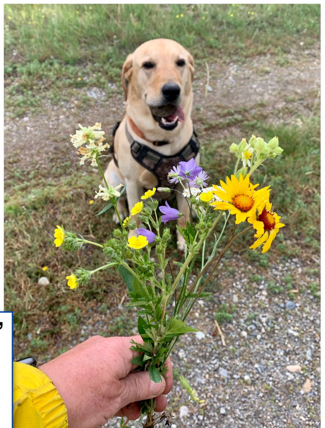
Right: Thumper doesn't care about inverted commas, he just wanted to give me this bunch of flowers.