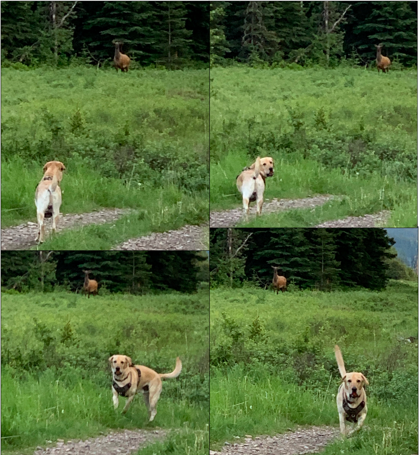
Thumper saw the Elk, he turned and looked for instructions, I called him back, and he came – good as gold!