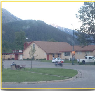
St. Michael's, Sparwood