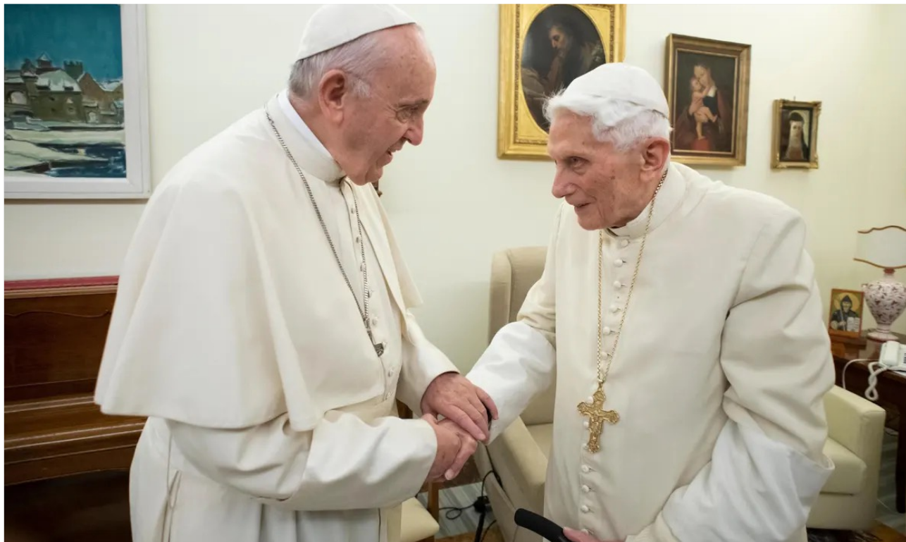
Pope Francis with Pope Emeritus Benedict four years ago