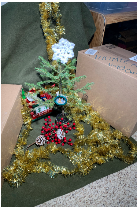
The tree at the start of Advent.