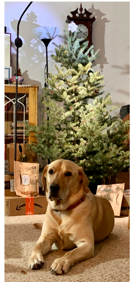
And the tree this week.