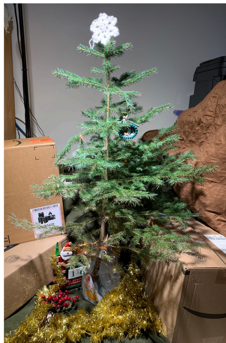
The tree mid-Advent.