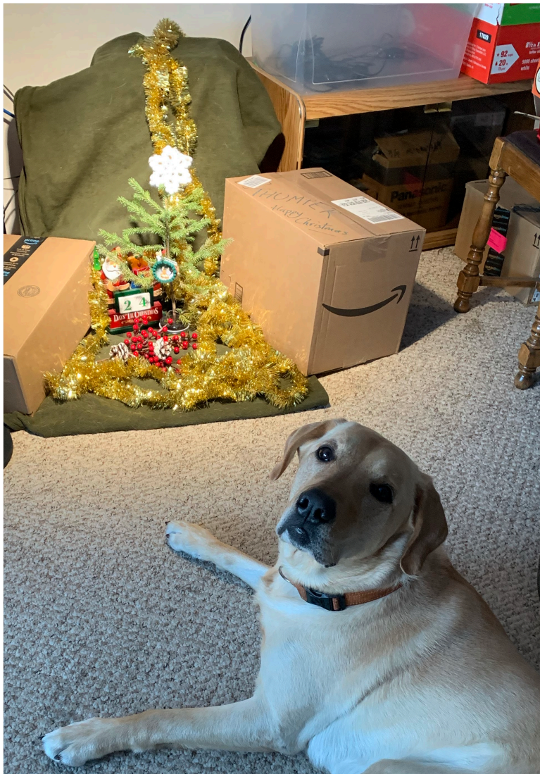
Thumper helping to set up the Christmas tree (which didn't take long!)