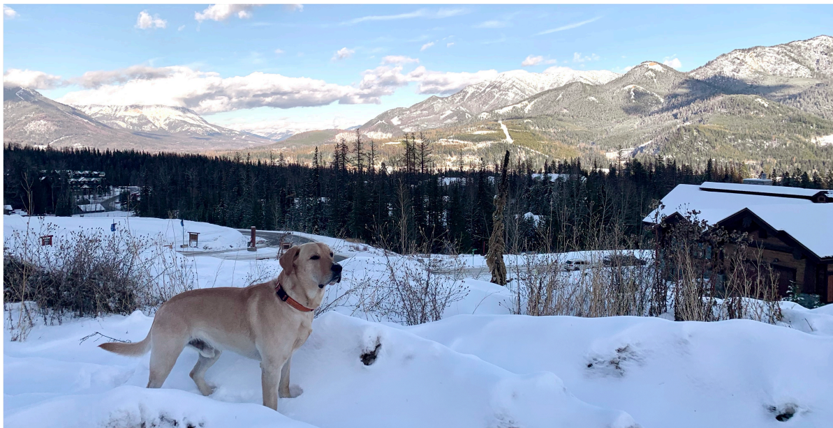
Thumper near Fernie Ski Hill where there is lots of snow but not much ice!