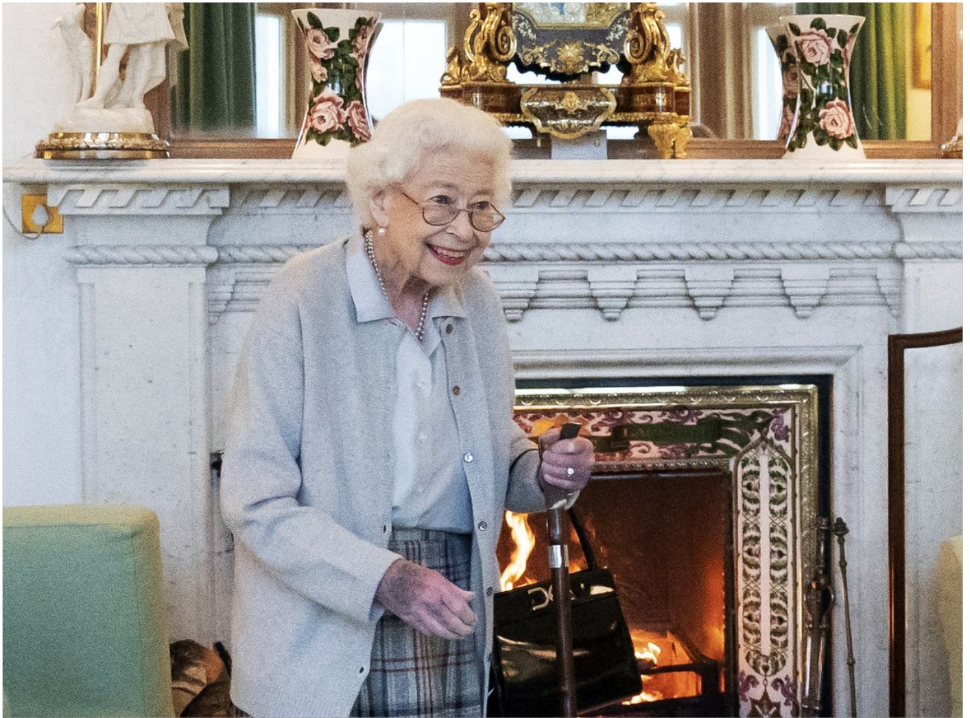
The Queen pictured on Tuesday this week in Balmoral.