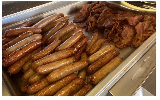
Left: Poutine instead of eggplant in maple syrup! Above: a mountain of bacon and sausages – wonderful.