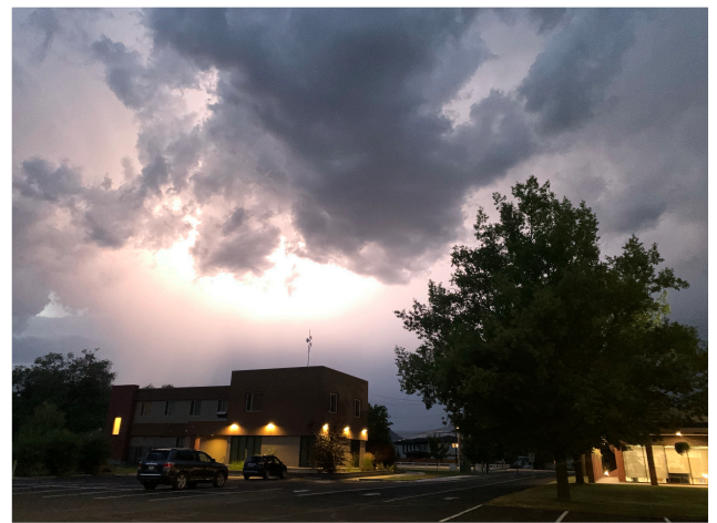
Top: camping overnight in the vehicle Below: lightning display above Kelowna