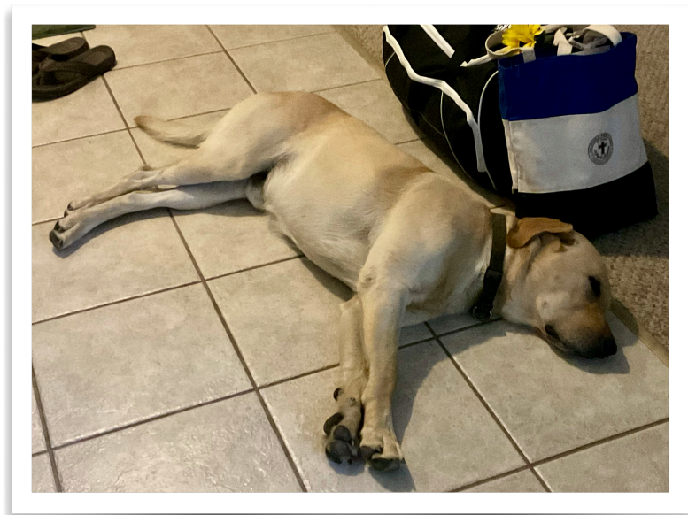
After a good run Thumper is keeping cool on the stone floor. I took his harness off him while he was in the kennels.

I have to say, I think he looks a little thinner, which might indicate that he has had a lot of exercise playing with the other dogs. While he was in the kennels I took his harness off him, and that might also make him look a bit thinner.