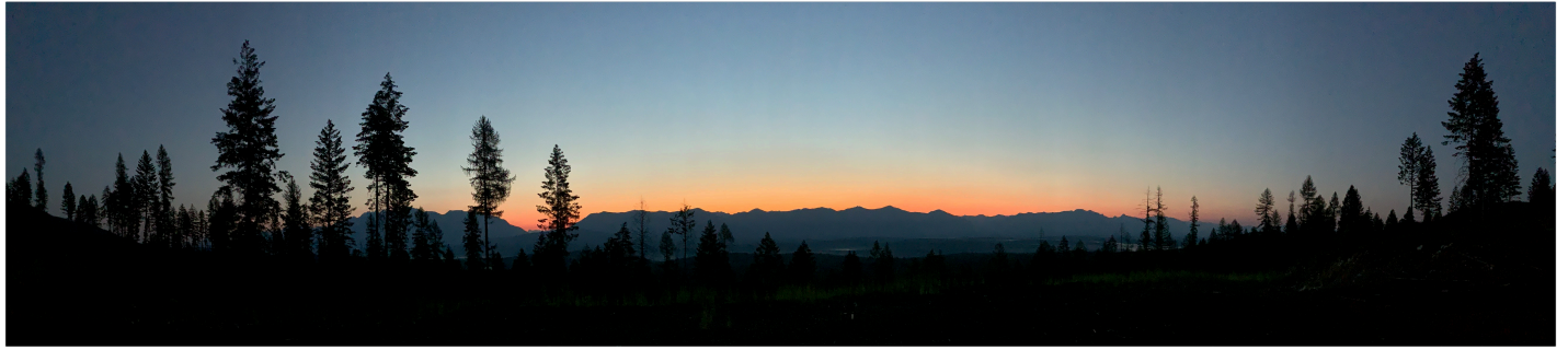
The view I had over the mountains from my Covid hideaway.

The Sunday Mass is broadcast via Zoom from Fernie & Sparwood (see below).