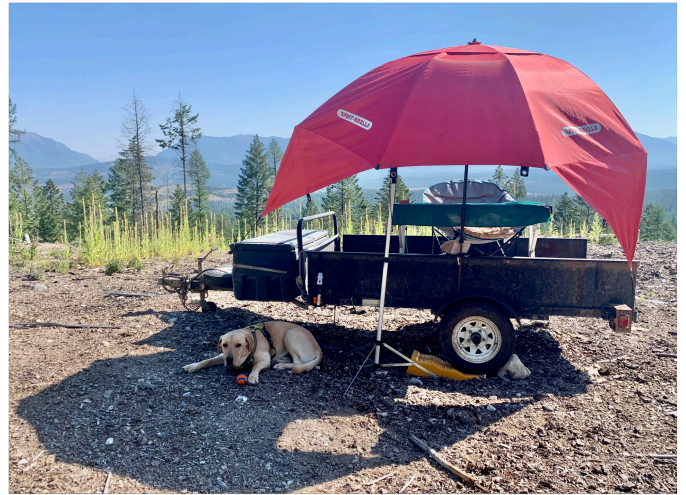
Have mobile altar, will travel! This is how I celebrated Mass last weekend.