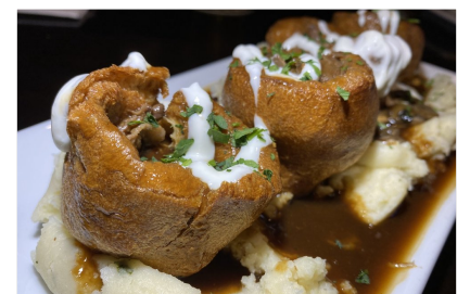
Dublin Crossing Irish Pub