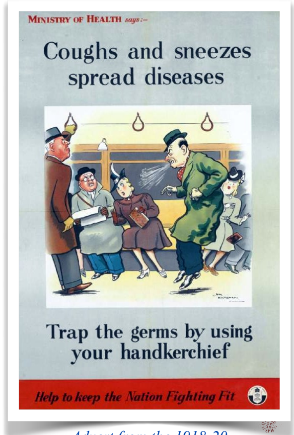
Advert from the 1918-20 Spanish Flu pandemic