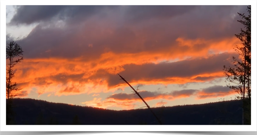
Top - the sun's rays shining from behind the mountain. Above - the evening sky of fire.

So even on cold and windy mornings, this valley is just such a wonderful example of the beauty of creation.