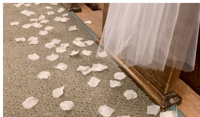
Petals scattered down the aisle of the church in preparation for today's wedding.