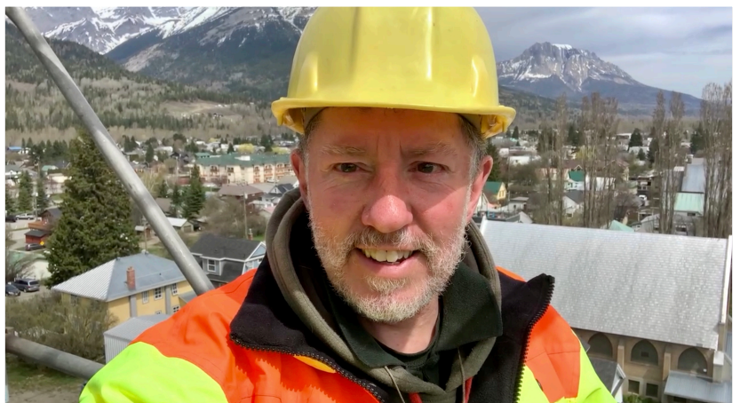
Once I got used to the height, I actually had a lot of fun up the tower.

Our hope is that after the work is complete the bell tower with its bright metal roof will be an even more stunning sight on the Fernie skyline.